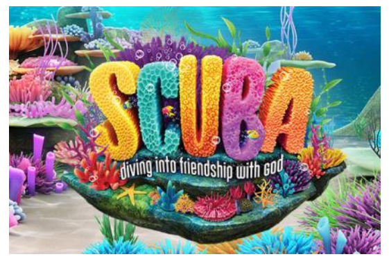
Save the Date! VBS is coming June 23-27! VBS is for 3 yrs. (potty-trained) - rising 5th graders! Watch for the notice to register your child and to volunteer coming this month! We need YOU to help make VBS a success!